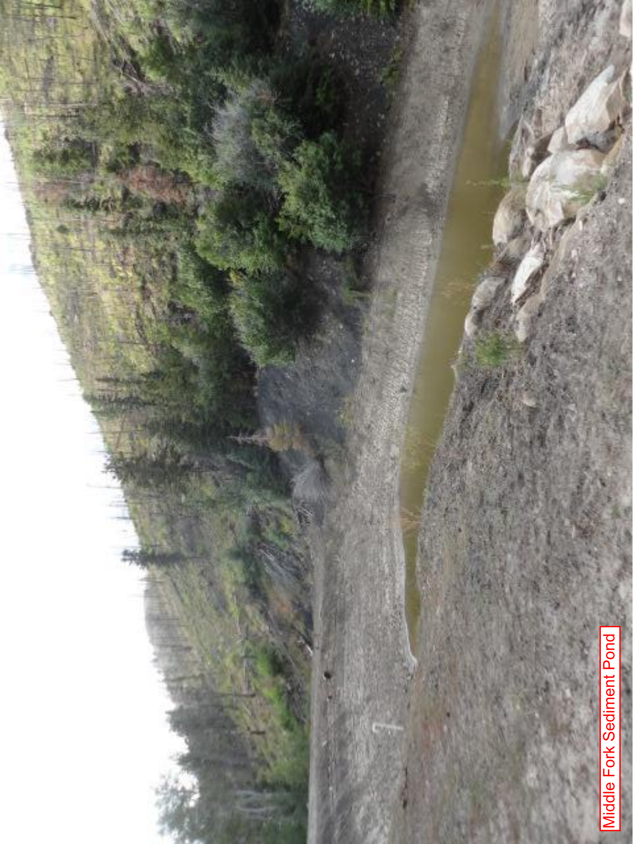
Middle Fork Sediment Pond