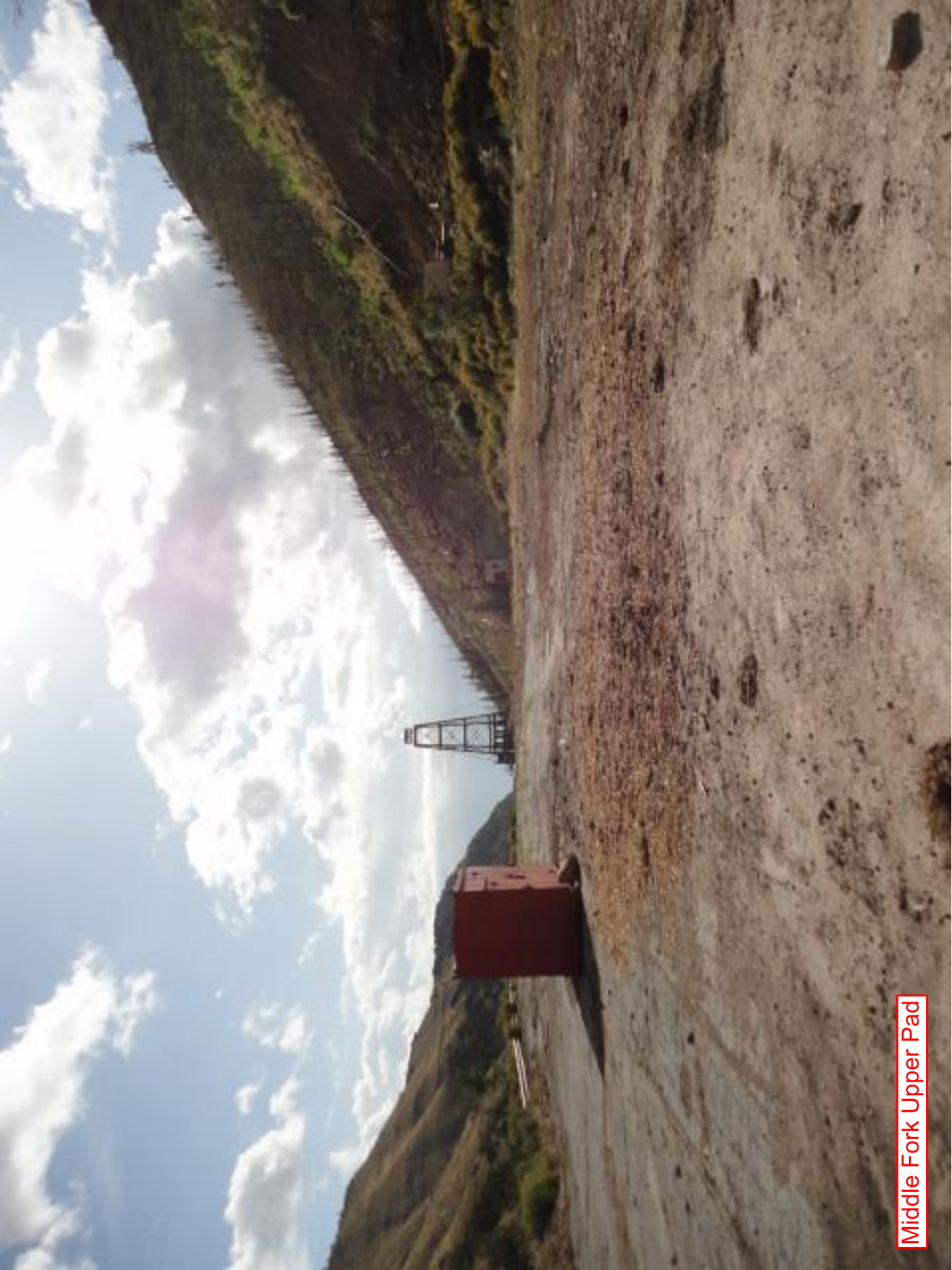
Middle Fork Upper Pad