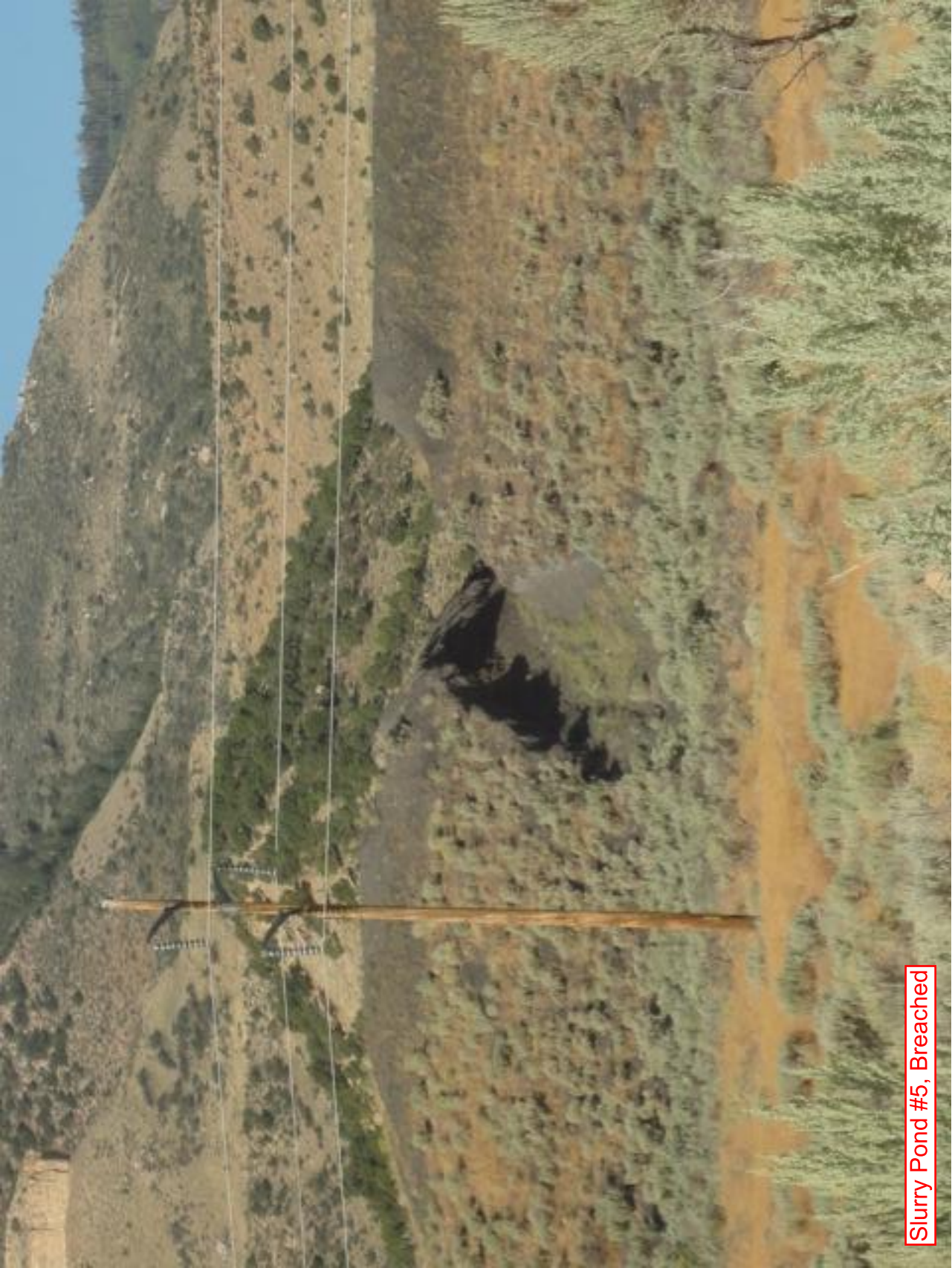
Slurry Pond #5, Breached