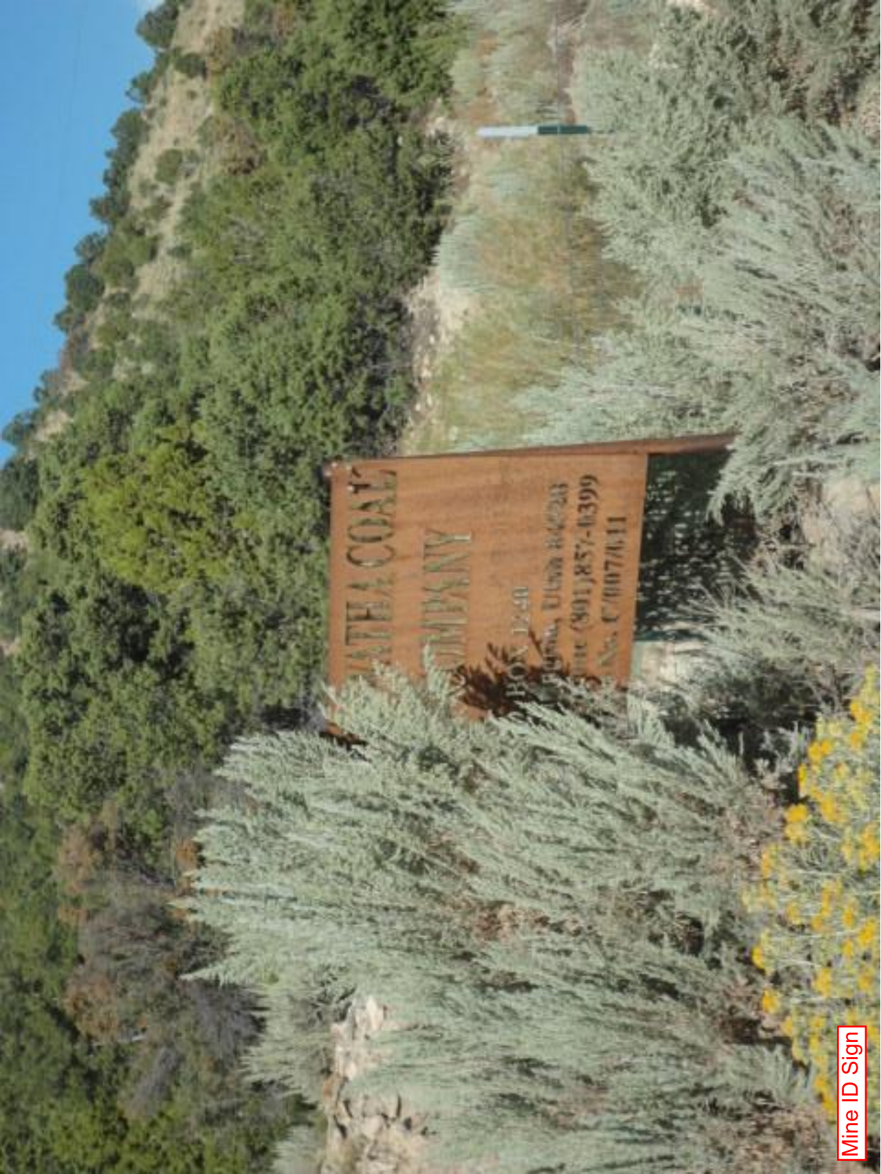
Mine ID Sign