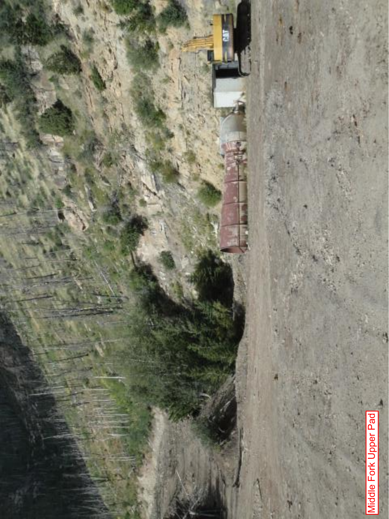
Middle Fork Upper Pad