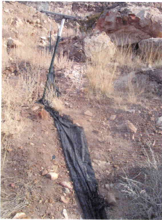
Photo 5. Unmaintained silt fence at toe of south bank of ROM coal pad. Ditch DD-8b is not evident at the toe of the bank. This area is not an ASCA per MRP Plate 7-5, and Ditch DD-8b has a design of 1 ft bottom width, 2:1 side slopes with minimum depth of 0.87 ft (0.37 ft flow depth plus 0.5 ft freeboard) (MRP Appendix 7-4).