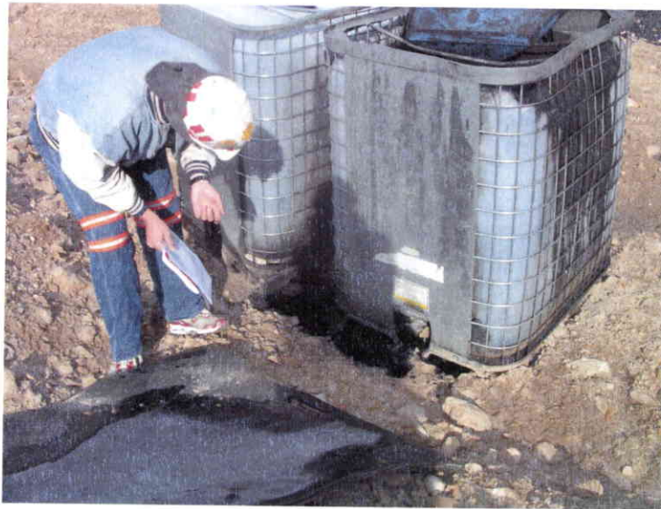
Photo 3. Chemical totes and unknown black liquid released to ground surface at south edge of ROM coal pad.