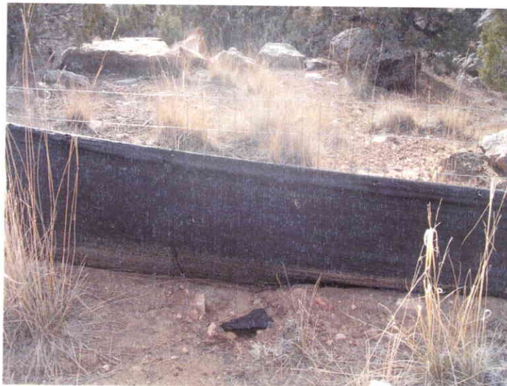
Photo 4. Unmaintained silt fence at location where runoff and sediment have flowed under silt fence and onto undisturbed area.