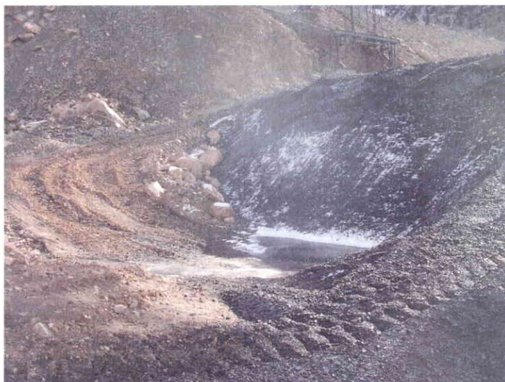
Photo 2. Pondered water and sediment/coal fines at NE corner of ROM coal pad. Neither culverts DC-5 nor DC-6 were visible.