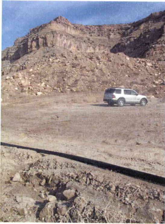
Photo 7. Southwest corner of topsoil pile. Operator has not constructed a berm/silt fence to prevent erosion of topsoil. Runoff from pile is visible along left side of photo.