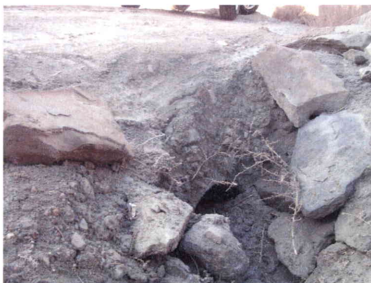
Photo 1. Partially blocked inlet to culvert in ditch DD-2a