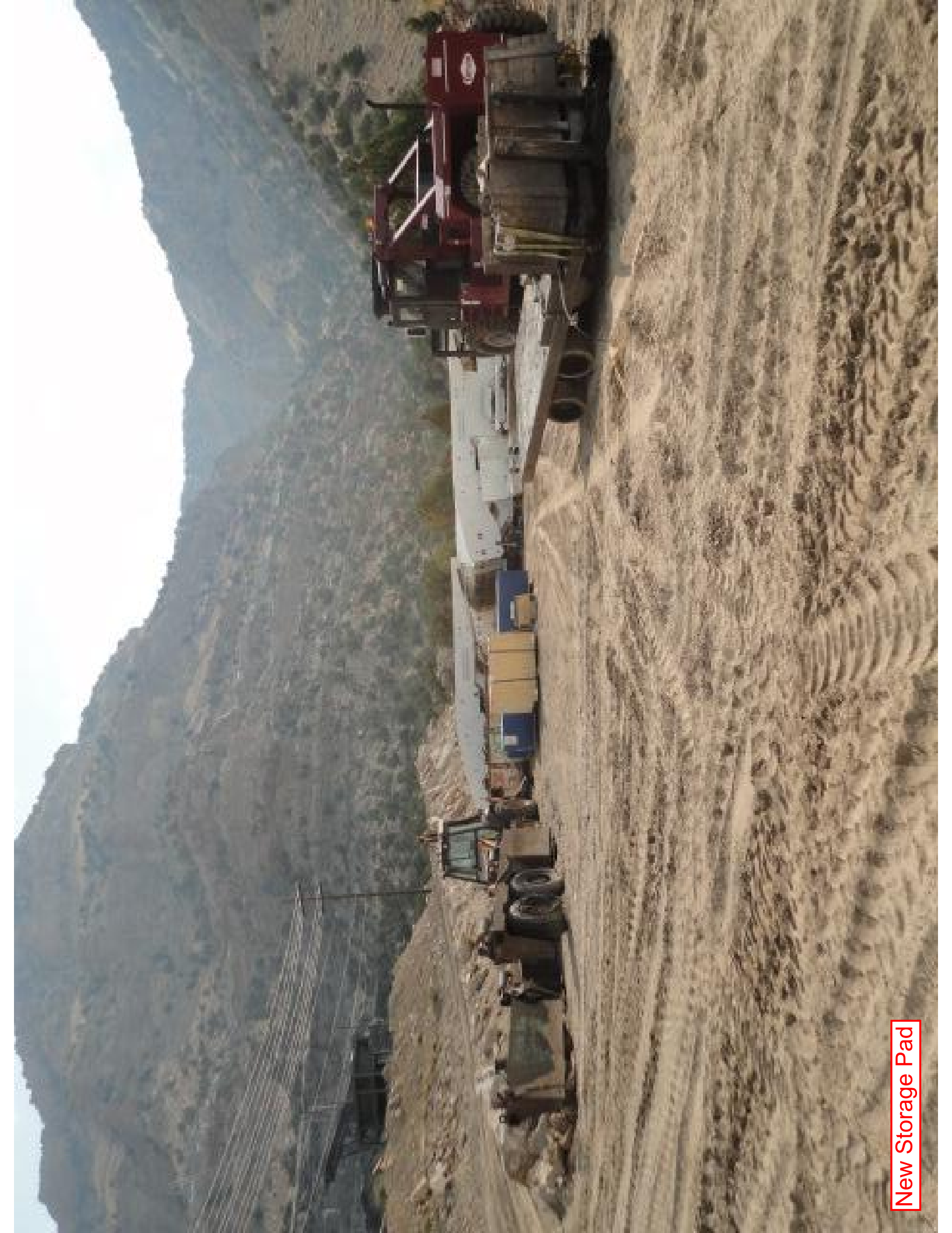
New Storage Pad