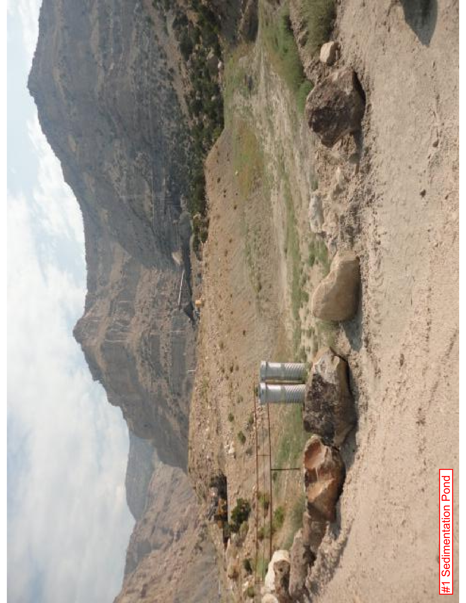
#1 Sedimentation Pond