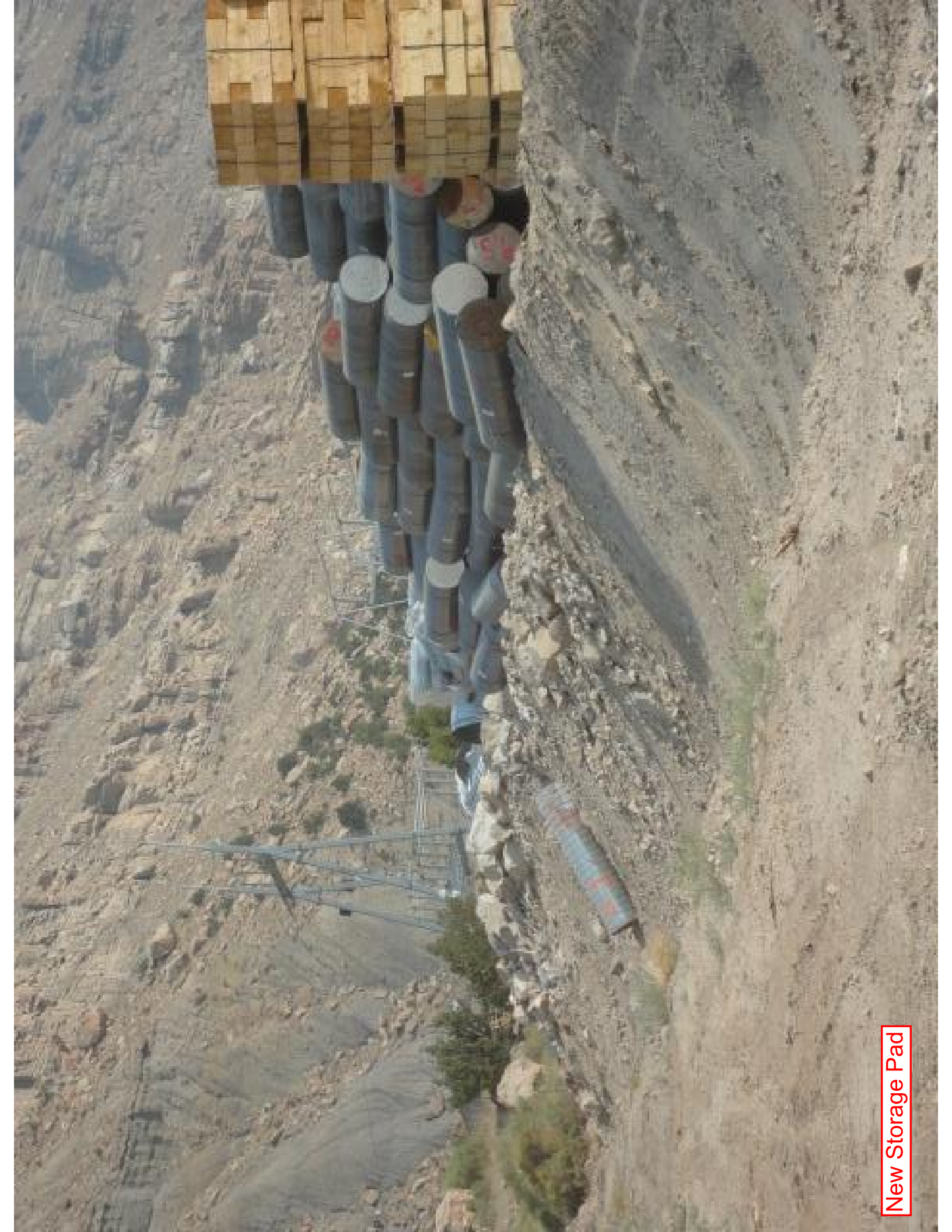
New Storage Pad