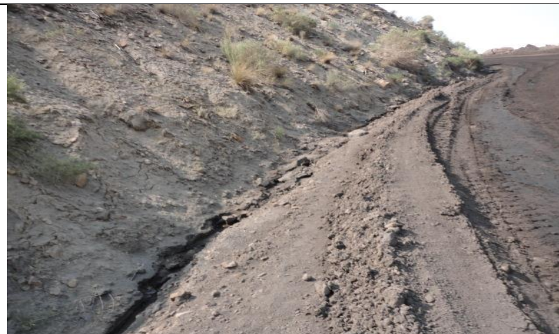
PHOTO 4 Diversion DD-1